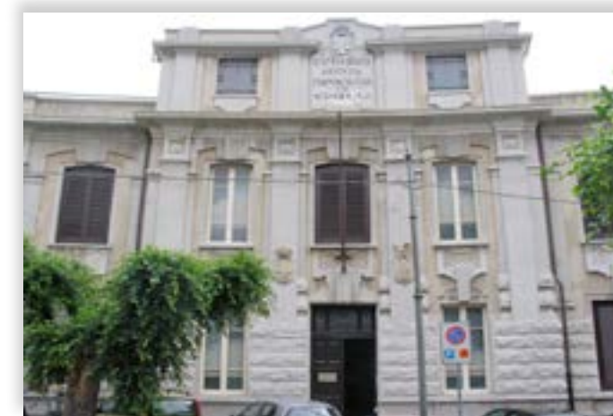
Department of Political Science