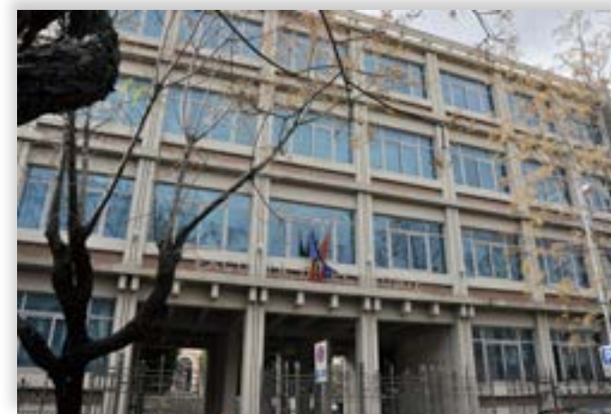
Department of Economics

Presentation video at https://www.unime.it/en/university/presentation and https://www.youtube.com/watch?v=3YujaP2pIUo