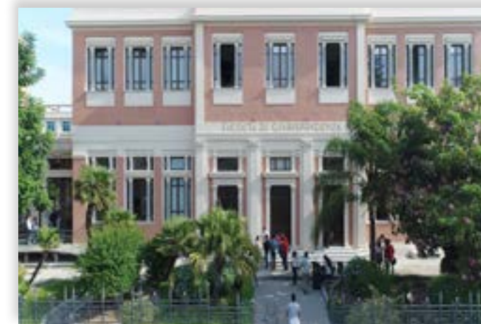
Department of Law