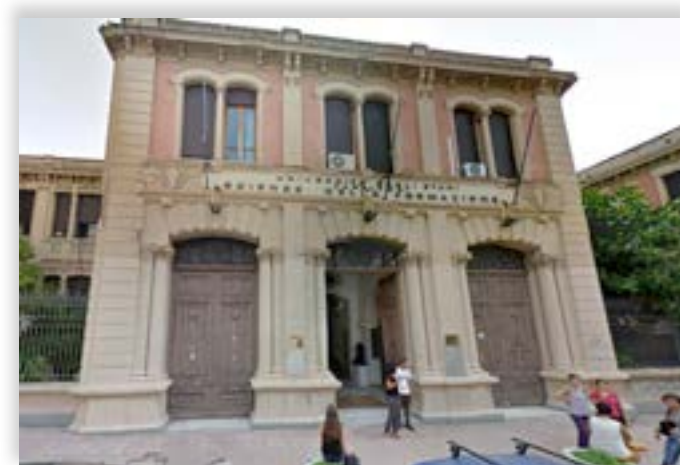
Department of Cognitive Science