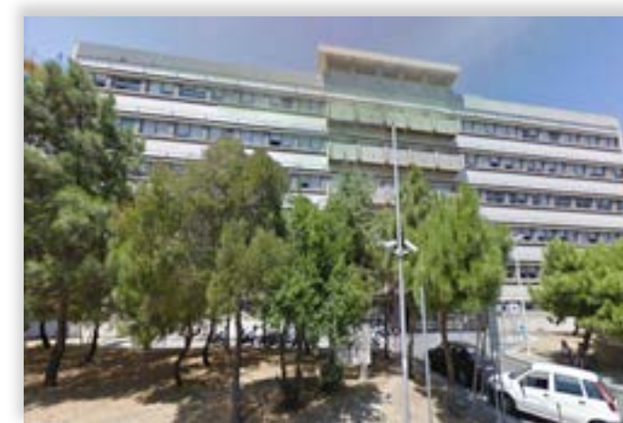
Department of Medicine