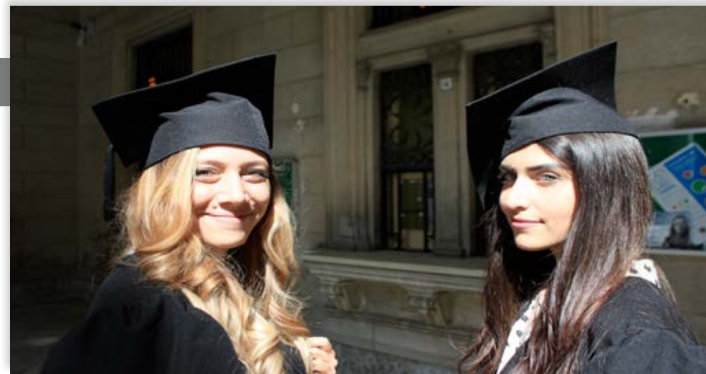
New graduate students

The academic year is divided into two semesters. Autumn semester usually begins in September and lasts until December, while spring semester courses start in February and finish in May. Exams can be taken at the end of the course attended. Winter exam session: January-February, summer exam session: May-July. Please note that some Departments may have different calendars and differences might exist among the starting dates of the courses.