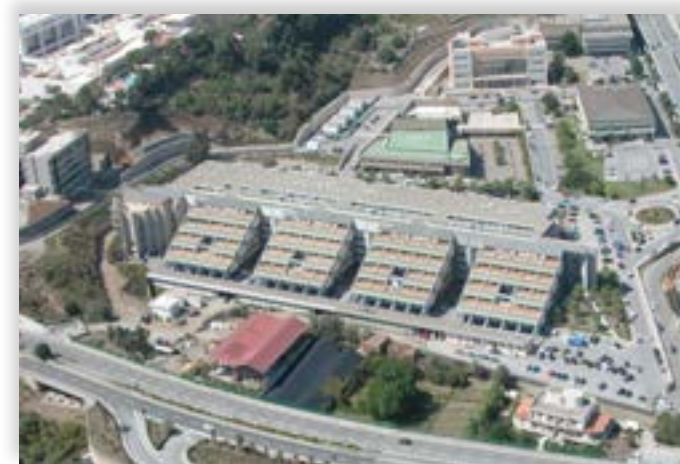
Department of Mathematics