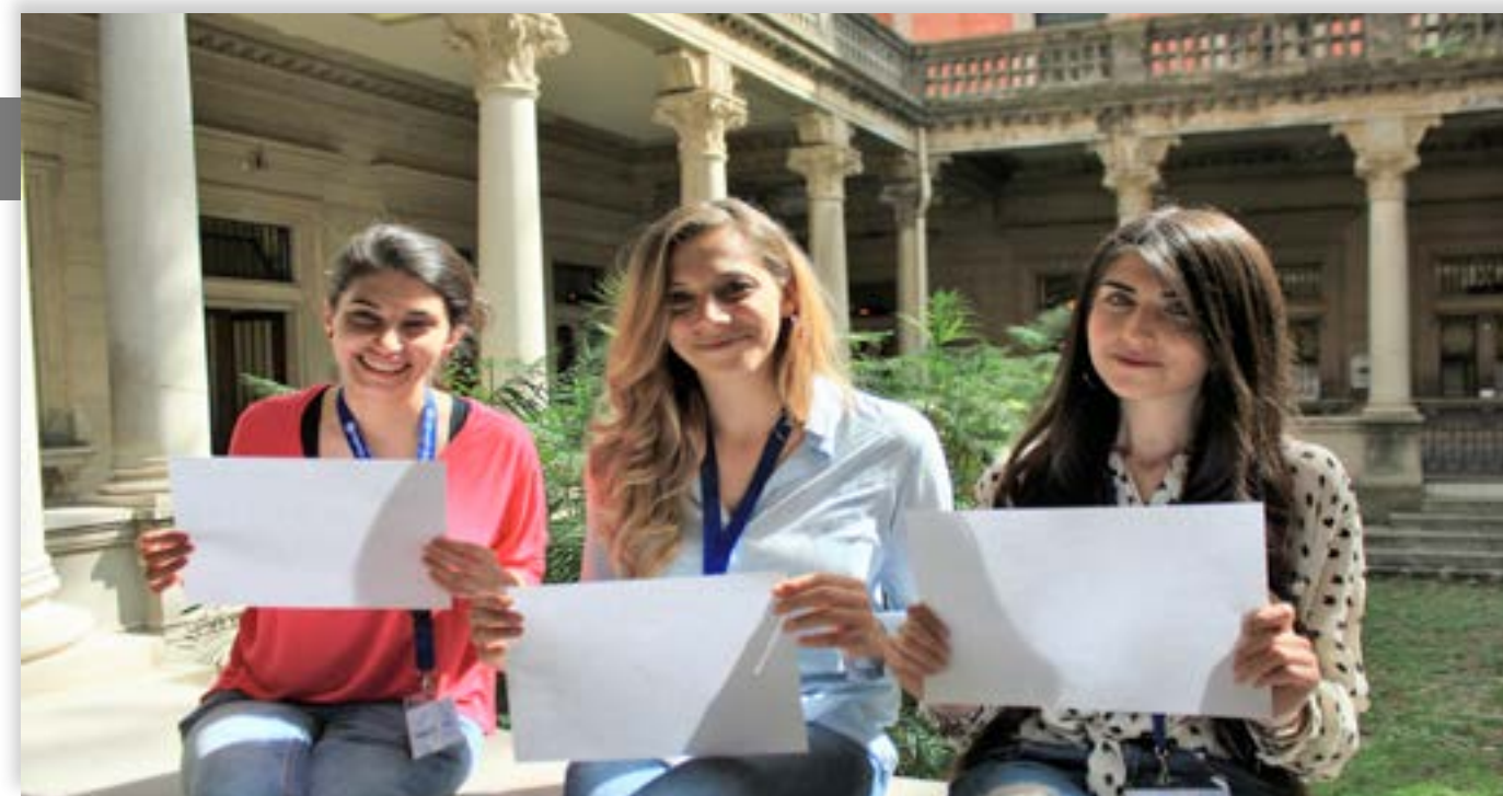
Students in the Secretary's office